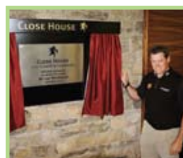
photo finish at close house

World number one, Lee Westwood, officially opens the new Colt Course and clubhouse at Close House